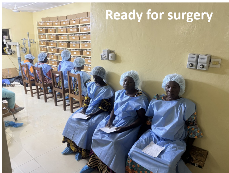
Ready for surgery